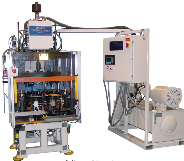
full machine view